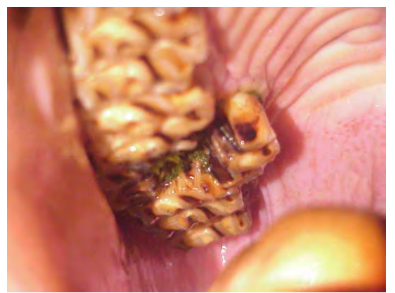
Figure 1. Split molar 109 due to infundibular caries.