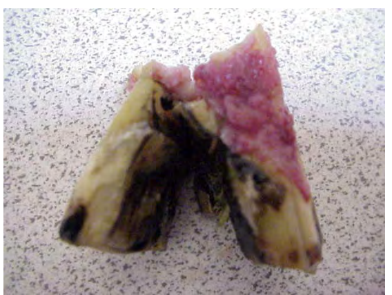
Figure 2. Split molar extracted due to infundibular caries.

can cause sinusitis and/or a draining fistulous tract. A modified Honma classification for tooth decay can be used to grade the severity of infundibular decay.<sup>1</sup>