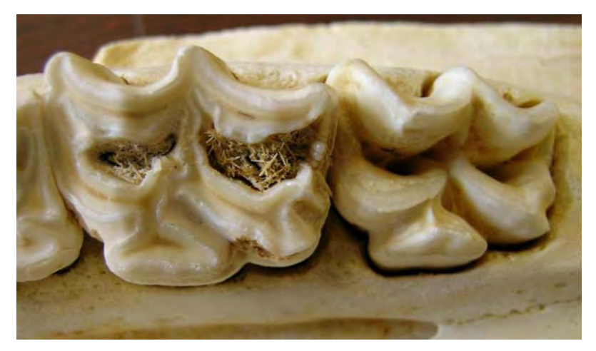
Fig. 6. Normal cheek teeth infundibula of a young horse. These teeth are not in full occlusion yet.

(100-200psi) with sodium bicarbonate/chlorhexidine solution to clean and disinfect.<sup>b</sup> The system also offers a high-speed drill, sonic scaler, venturi suction and triplex syringe for air and water. A surgical length ball-type of burr can be used for the majority of dental material removal and a smaller fissure type of burr is useful for the intricate infoldings of the infundibulum. Air abrasion with 25-micron diameter aluminum oxide powder at 150-200psi pressure will aid in removing decayed tooth without harming the healthy tooth material. One must allow adequate time to do a complete preparation of the carious infundibula, which involves multiple cleanings, rinses and rechecking with the mirror. The utmost care must be taken not to drill through the enamel of the infundibulum and into the pulp canal or sensitive dentine. Repeated use of a dental mirror will allow removal of only the decayed portion of the tooth.