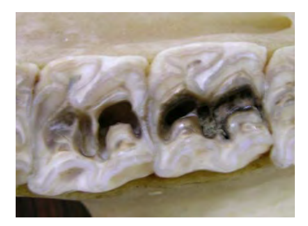
Figure 5. Infundibular caries of the rostral infundibulum of 109 and of both infundibula of 110 with coalescence of the latter infundibula.

pulp may not produce secondary dentine to seal the pulp canal. Over time as the existing secondary dentine on the occlusal surface is worn away, the open pulp chamber will be exposed and cause contamination of the interior of the tooth and apical abscess formation. Aggressive reduction of the premolars (creating large 'bit seats') can also cause this damage to the sensitive pulp (Fig. 4). Occasionally, if the damage is not too severe, the pulp chamber may be sealed with tertiary dentine proximal to the damage.